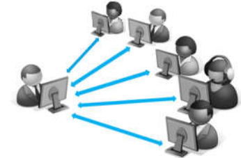
IES Academy Virtual Classroom

The regulatory requirement for Design-for-Safety (DfS) was enforced since August 2016. It requires stakeholders to work together to address foreseeable design risks right from the conceptual design to the construction of the project. During the construction stage, the DfS review meetings will involve the design & supervision team from the Consultants and construction team from the Contractor. They will participate in reviewing safety and health risks relating to design or construction method, and propose mitigation measures for implementation.