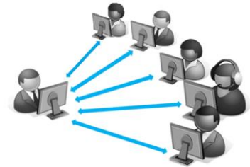
IES Academy Virtual Classroom

The regulatory requirement for Design-for-Safety (DfS) was enforced since August 2016. It requires stakeholders to work together to address foreseeable risks right from the conceptual design to the construction of the project. During the construction stage, the DfS review meetings will involve the design & supervision team from the Consultants and construction team from the Contractor. They will participate in reviewing safety and health risks relating to design and propose mitigation measures for implementation.