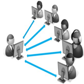
IES Academy Virtual Classroom

Prior to attending this course, you should: Have a PC / laptop / tablet / smart phone with built-in or external webcam. Installed the Zoom client. Have Wi-Fi / high speed internet connection available. Receive an email with a link for you to submit a registration for webinar 1 week prior to the commencement. Receive an email with a link and password for you to join the webinar session after your registration is successful.