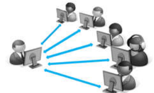
IES Academy Virtual

Design risk can be managed effectively by identifying the hazard and controlling the risk through Design for Safety (DfS) reviews during project development. Designing for safety should start at the early stage of a project whereby key stakeholders will review the design progressively to identify hazards on the building layout, materials used and construction methods etc. so as to enhance the safety of the project for construction as well as operation and maintenance.