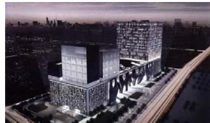
Shanghai's Himalayas Centre