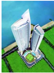
The Sail @ Marina Bay