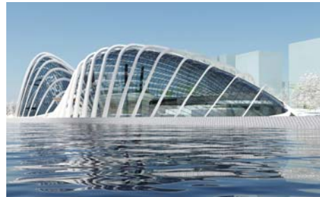
Gardens by the Bay