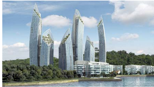
Reflections at Keppel Bay