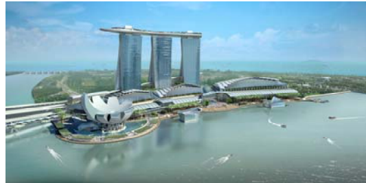
Marina Bay Sands