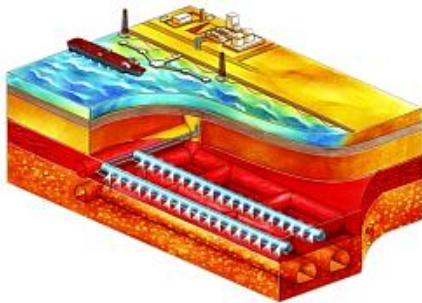
Jurong Rock Cavern