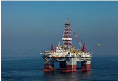
Keppel Mega Semi Submersible