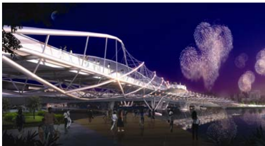
The "DNA" Footbridge, Singapore